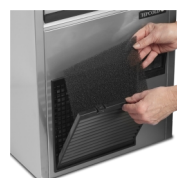
Easy to clean condenser filter